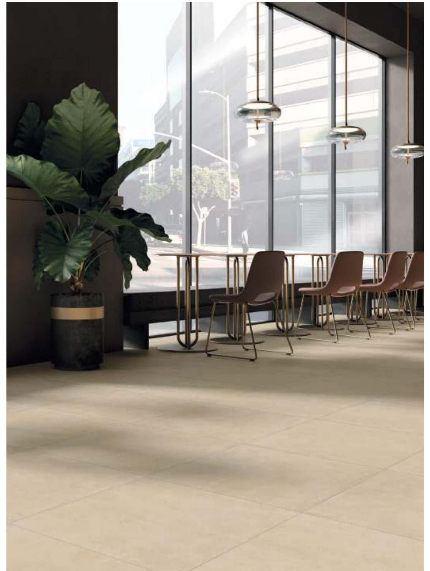
^ Concrete Beige 60x60

Guarda la tabella completa dei pezzi speciali a pagina 198 View the complete special trims tabel at page 198